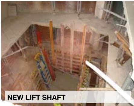
NEW LIFT SHAFT

A lift will be installed in the car park adjacent to the main car park steps at the front of the club on Ryedale Road. The works encompass a new all weather awning and lift foyer area and will service all levels of the car park. All levels of the car park where the lift is being constructed are partitioned off. The demolition segment has been completed and the task of building the lift shaft is well underway and by the time members read this report, the actual shell of the shaft should be complete and the task of fitout can commence. The expected completion is May 2010.