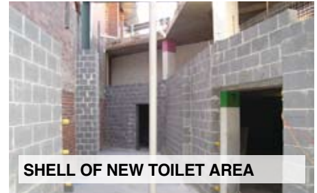
SHELL OF NEW TOILET AREA

There is a viewing window into the gaming area construction. The viewing window is located opposite the main bar. Members will be able to see the new wall and outdoor area taking shape and monitor the progress of the fitout. These areas are programmed to be ready in mid December. Updated information re the opening will be displayed in the Club foyer in November and also on the Club's website www.releagues.com.au .